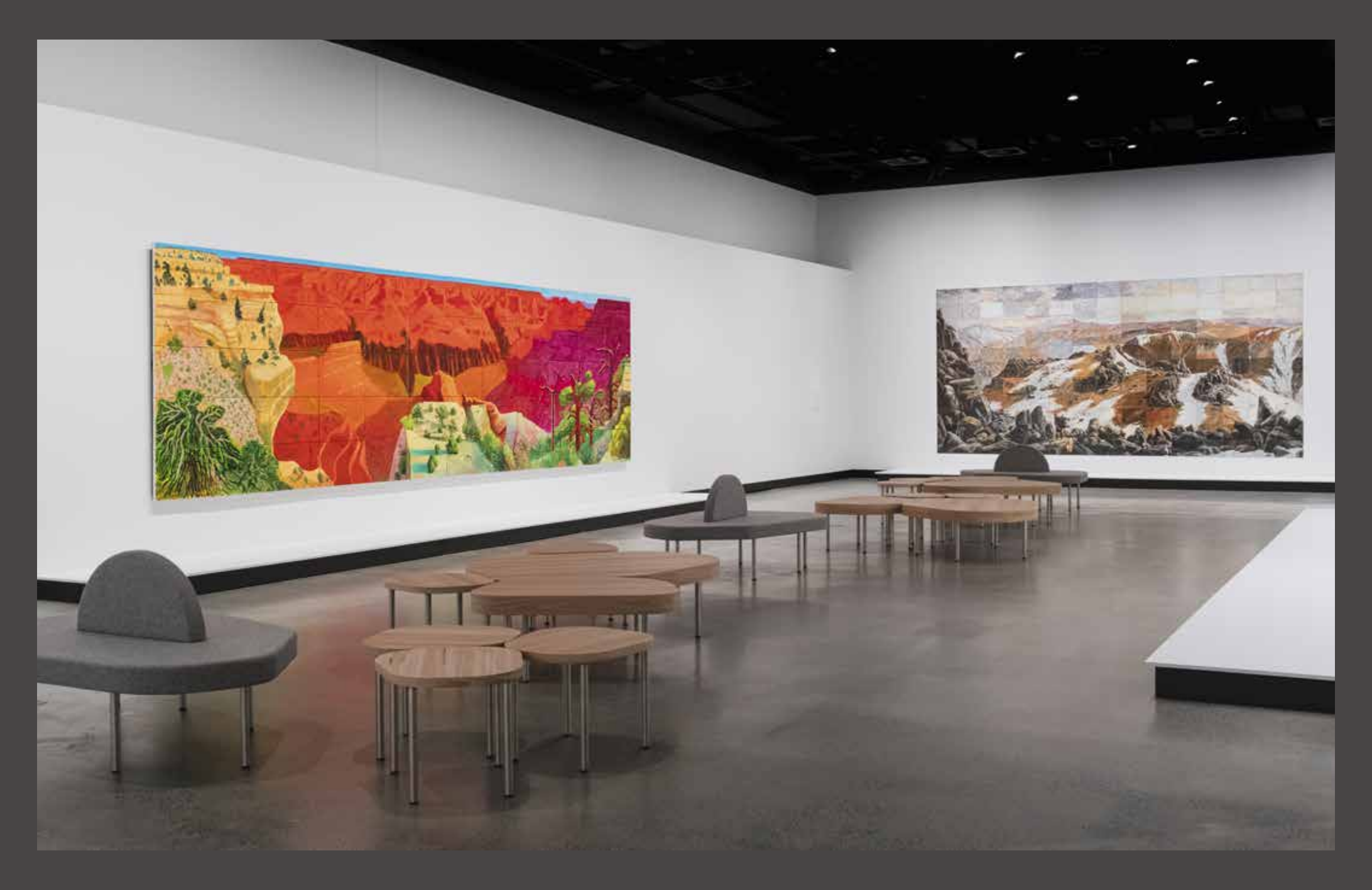
Installation View - A Bigger View, Imants Tillers, Mount Analogue 1985, National Gallery of Australia, Kamberri/Canberra, purchased 1987 Courtesy of the artist. David Hockney, A Bigger Grand Canyon 1998, National Gallery of Australia, Kamberri/Canberra, purchased with the assistance of Kerry Stokes, Carol and Tony Berg and the O'Reilly family 1999 © David Hockney.