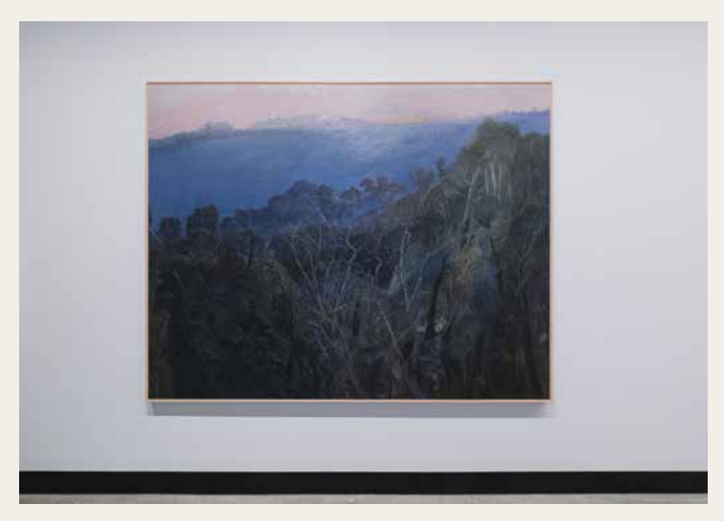
Installation View - A Bigger View, William Robinson's Springbrook Dawn, 1999 is a captivating landscape painting that captures the essence of the Australian rainforest.