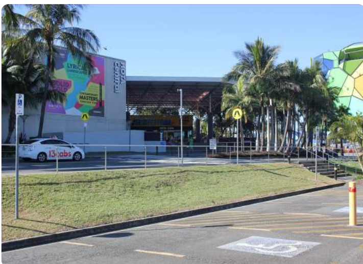
Accessible parking at HOTA Central