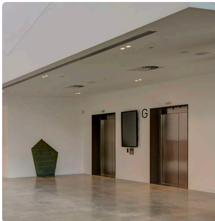
You can use the lifts