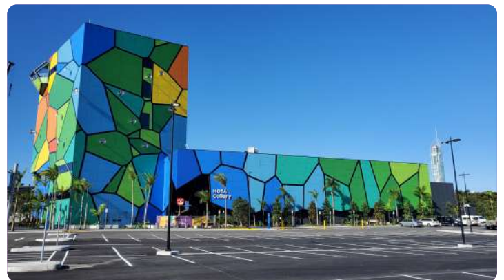
HOTA Gallery Car park