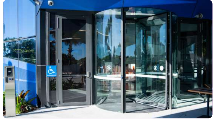
Accessible entrance at ground level

There are side entrances beside the revolving door. These doors provide wheelchair access to the Gallery.