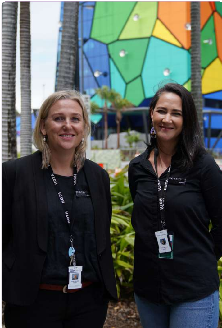
HOTA Gallery staff