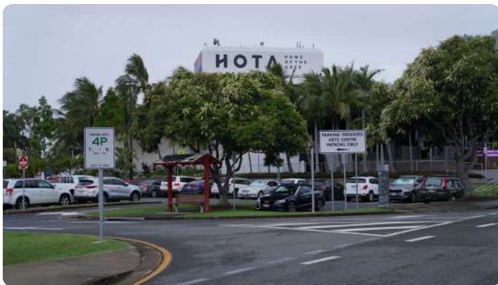
Car park at HOTA Central

The carpark can be busy allow extra time if you are travelling by car. You can park in front of HOTA Central and walk across to the Gallery. You can also park in the HOTA Gallery car park.