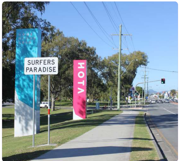
Entrance from Bundall Road