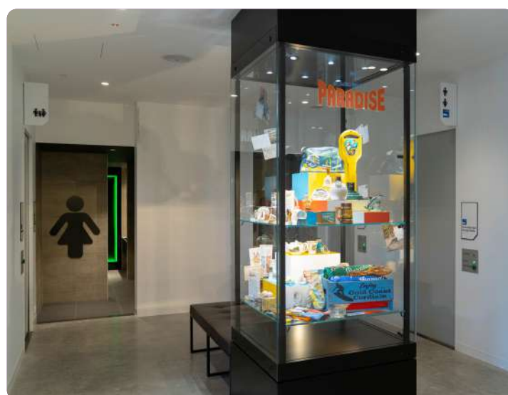
Accessible Toilet and Adult Change Facility

There are baby change facilities on the lower ground floor.