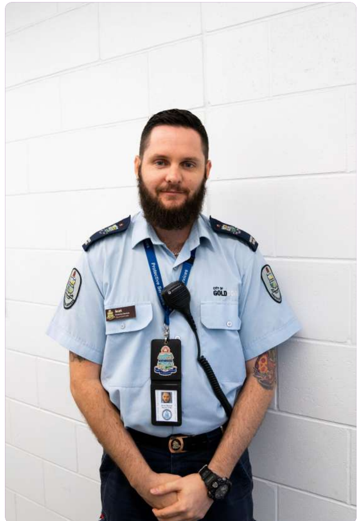
Protective Services Officer