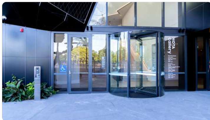
Accessible entrance at lower ground