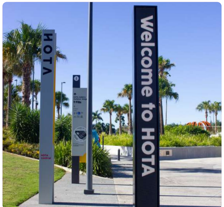
Look for these signs