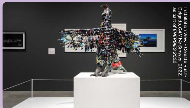
Installation View - Celeste Rush-Deigado, CAN We Survive (2022) as part of ENERGIES 2022

The person facing away may ask questions such as: What is the artist's name? What materials have they used to create the artwork? Together they must rely on their observation and conversation skills to interpret the meaning of the artwork.