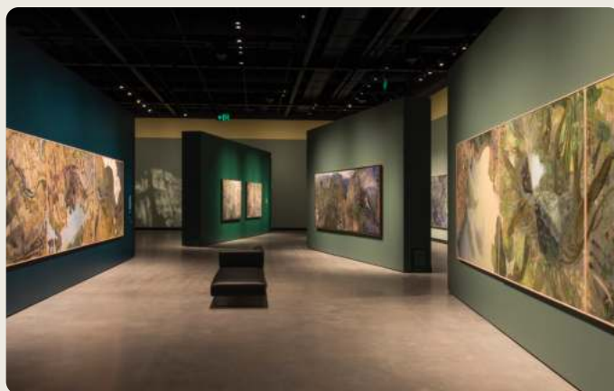
Installation View - William Robinson - Lyrical Landscapes: The Art of William Robinson

The ground floor is also home to the Studio, our fine dining restaurant, Palette, and the HOTA Shop. From here you may exit HOTA Gallery and head towards HOTA Central, HOTA Café, the Outdoor Stage, or surrounding parklands. If you have bags in storage, take the stairs down to the lower ground and collect them with assistance from a VSO.