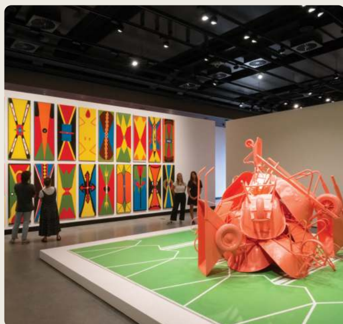
Installation View - Yuriyol Eric Bridgeman: A barrow, a singsing

Take the stairs or lift down to Level 2.