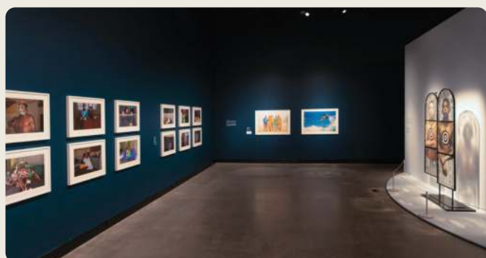
Installation View - Punching Up: 21st Century Indigenous Photography

ASK: What materials can you see? How do you know this?